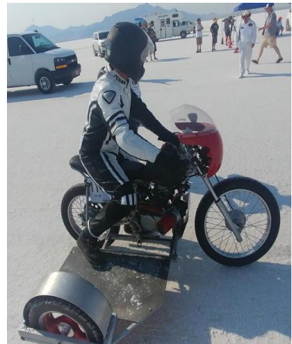
Al, 100cc Sidecar