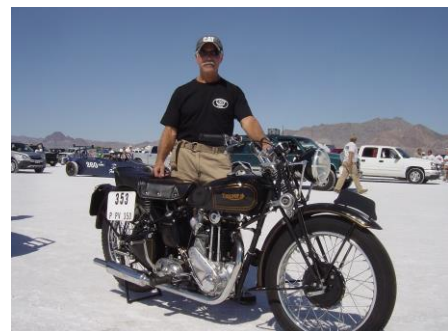
'45 Triumph 3H, 350cc