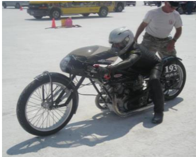
'67 Triumph, 650cc