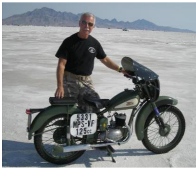
'51 BSA Bantam, 125cc