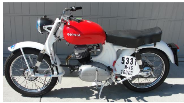
'54 Focesi Gloria, 100cc